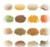
Cover Crop Mixes